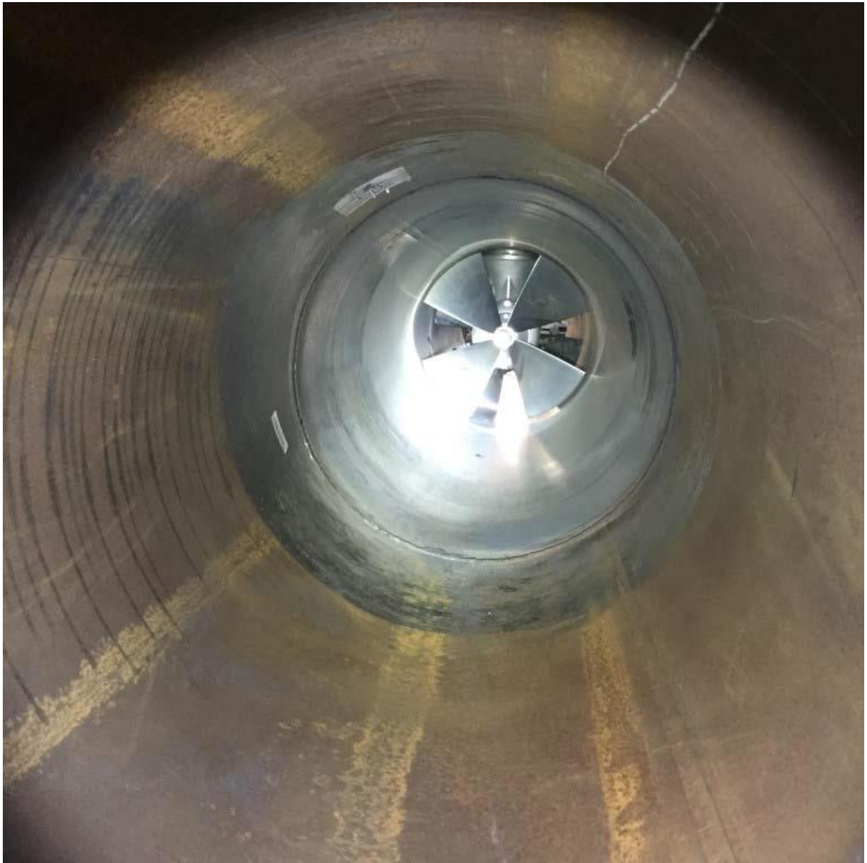
Inside the thruster tunnel