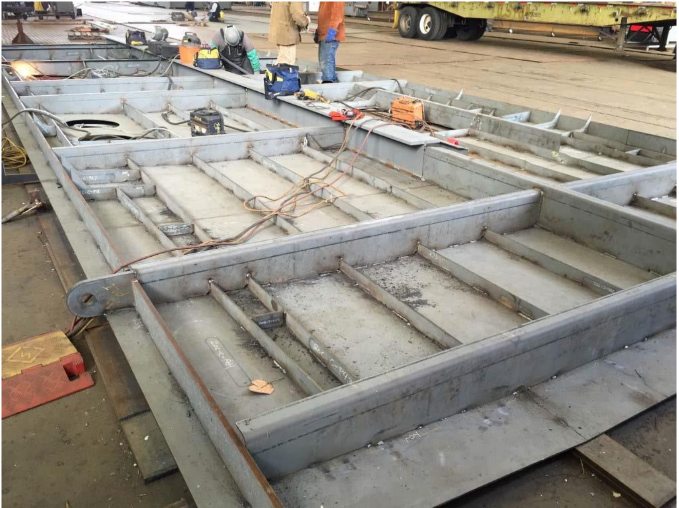
Main Deck Structure Shown Under Construction Upside-Down with Lifting Pads