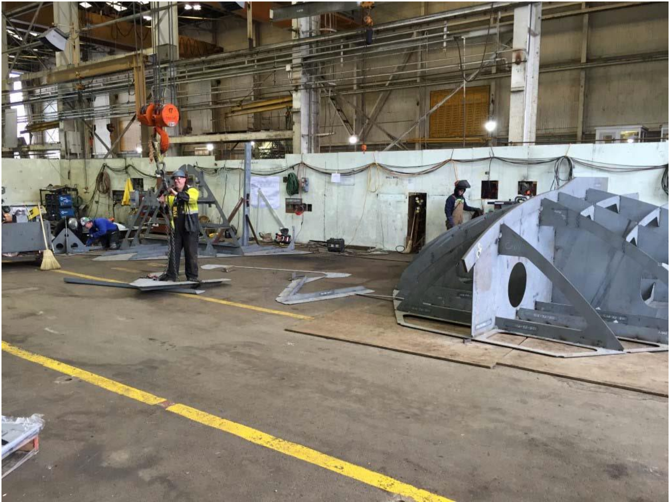
Bow Section and Neighboring Structure Under Assembly at Vigor